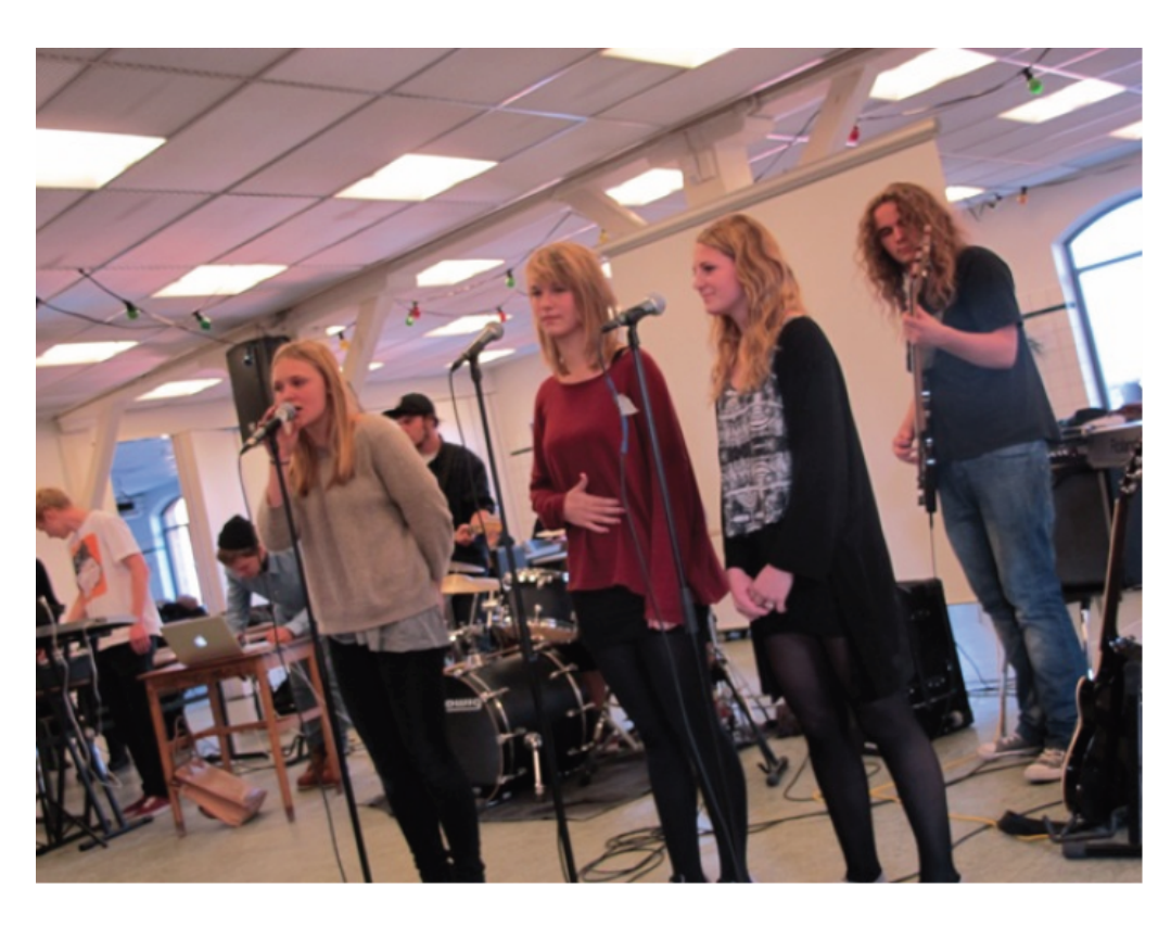
Figure 2: UN Day student peace prize presentations at Christianshavns Gymnasium. Members of one of the competing groups make their presentation.