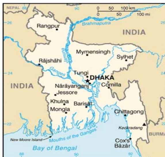
Figure I. Map of Bangladesh

After the building collapse, reportedly, thousands of workers took to the streets and vandalized vehicles and shops before being dispersed by police. Soon after that, the government initially shut down 18 apparel factories, for safety reasons, as concerns about industrial safety across the country continued to grow. 6