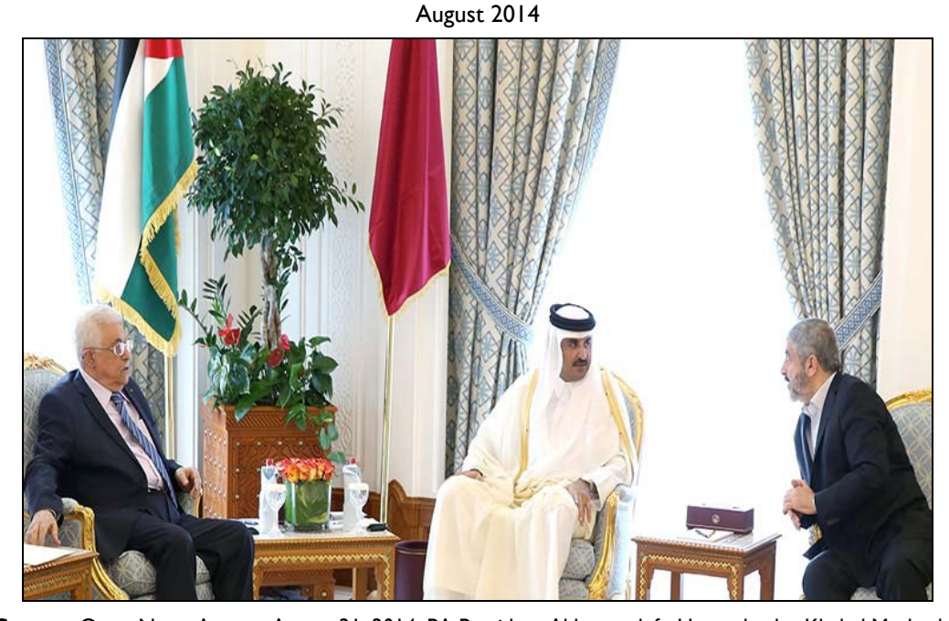
Figure 2. Qatar's Emir Hosts Palestinian Leaders

not blamed. For the enemy to attack it, this is a source of pride for Qatar and is evidence of the correctness of the Qatari position.<sup>38</sup>