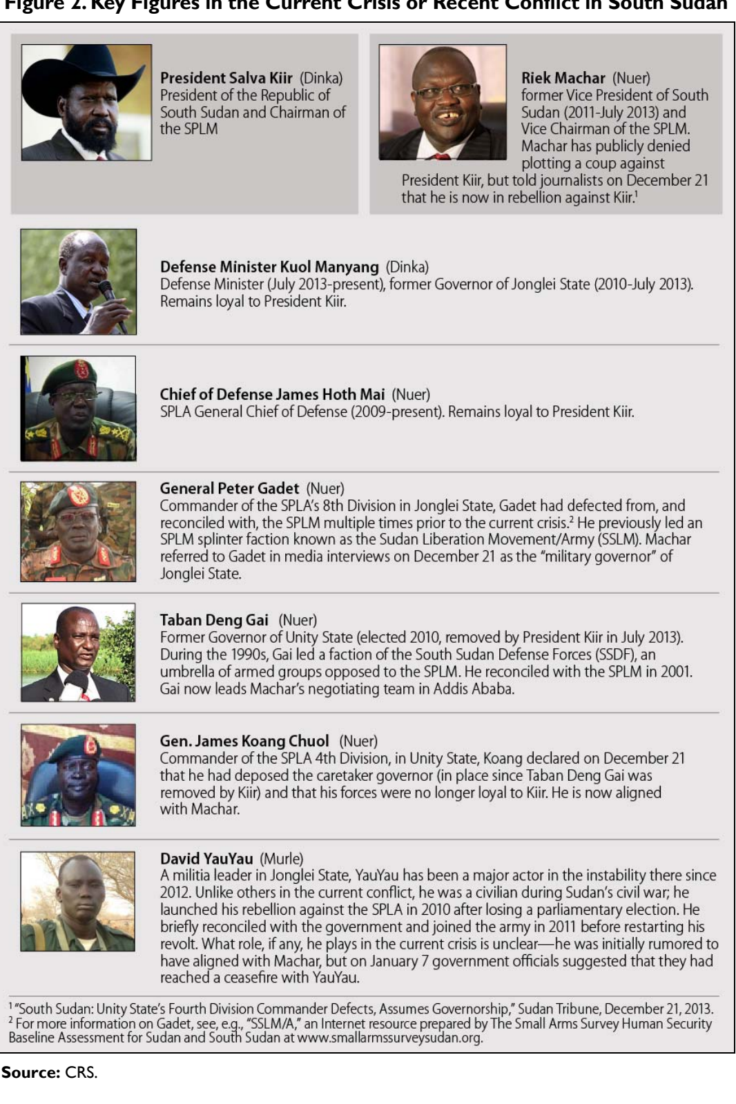
Figure 2. Key Figures in the Current Crisis or Recent Conflict in South Sudan