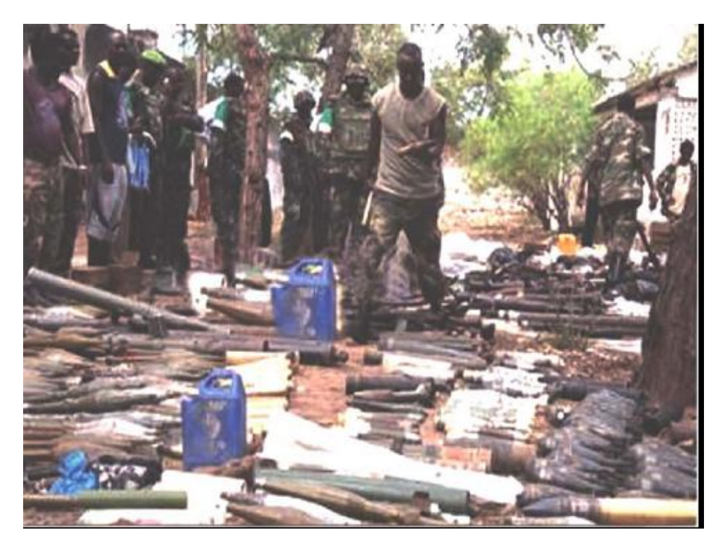
47. That information and photograph confirm the information contained in the previous report of the Monitoring Group (see S/2006/913, paras. 211-217) with regard to the massive quantities of arms and military equipment received by ICU/Shabaab and the large quantities of arms flowing into Somalia.