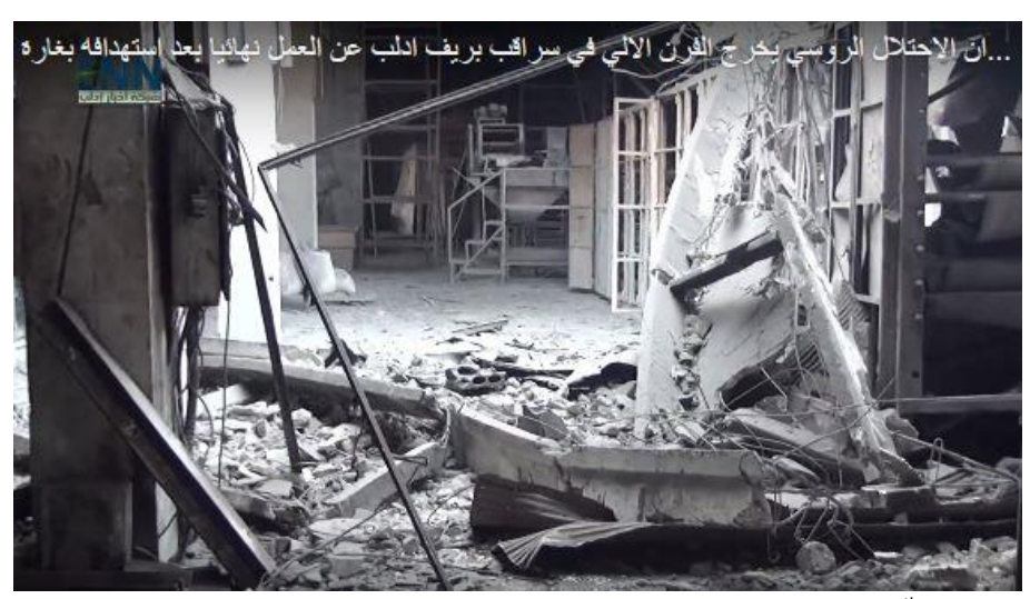
Saraqib bakery – destroyed in a reported Russian strike on November 17<sup>th</sup>

In November alone, bakeries were targeted in airstrikes at Al Atarib, Qaryatain, Benin and Saraqib. A water treatment plant at Al Khafsa was destroyed, while water wells at Maarat al Numan and Ghareya were bombed. Food trucks were targeted at Al Dana and Azaz, and medical facilities credibly reported hit at Sakik, Raqaa and al Bukamal.