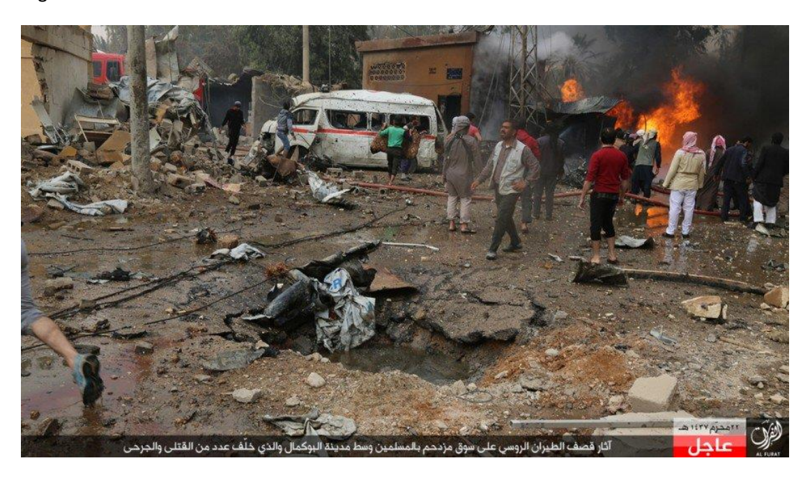
Remains of an ambulance following alleged strikes by Russia at Al Bukamal November 5th

Often these civilians were killed in ones and twos – most likely 'collateral damage' as a result of rebels or other objects being targeted. On November 5<sup>th</sup> 2015 for example, <u>Abd al-Kareem al-Alawi</u> and another unnamed civilian died when Russian aircraft reportedly struck the town of Qaryatain in Homs governorate.