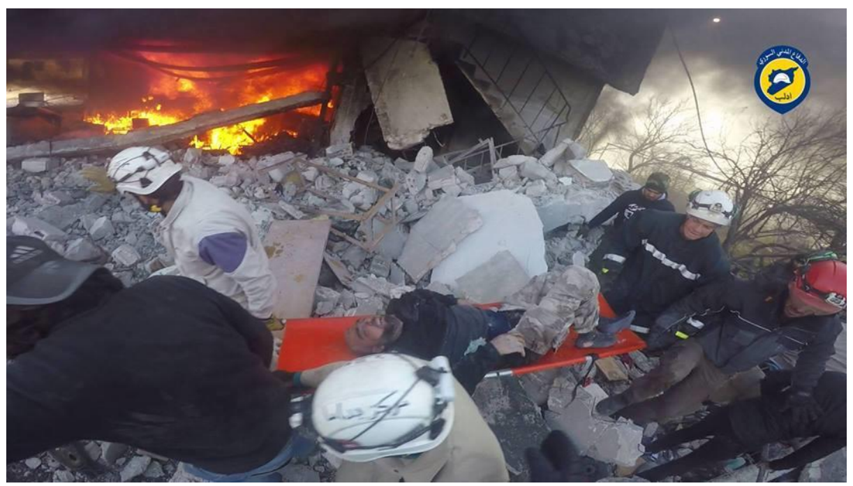
Fires blaze as rescuers aid a man at the site of an alleged Russian strike on Bdama, Idlib on December 22nd

Database indicates over 1,000 civilians credibly reported killed in first three months of Russia's air campaign in Syria