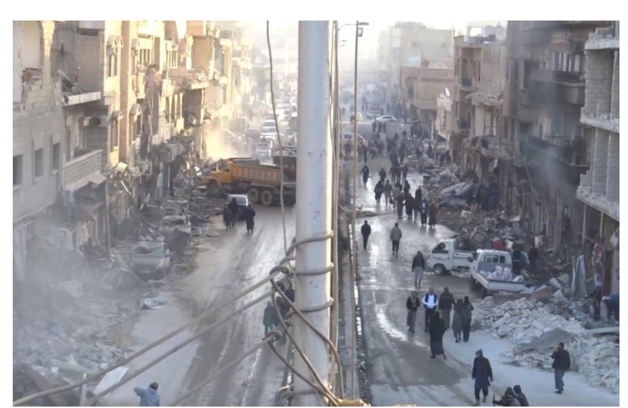
Raqqa following an alleged Russian or Coalition strike, December 26<sup>th</sup> 2015

However the agreement brought little clarity for affected civilians on the ground. Four locations in particular (Raqaa, Al Bab, Palmyra and Al Bukamal) have been targeted by both Russian and Coalition airstrikes – sometimes on the same day.