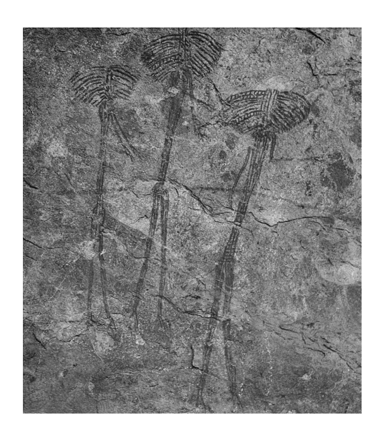
Early red paintings at the Kolo complex