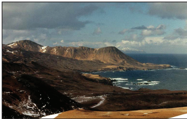
Amchitka Island; View From the East End Looking North

Anomalous concentrations of tritium (a radioactive isotope of hydrogen with a half-life of 12.3 years and also a “fingerprint” left by a nuclear detonation) were detected in surface water samples collected near the Long Shot test site. Tritium activity was monitored in samples of surface water and shallow groundwater from 1965 to 2001. The maximum detected concentration was about 16,000 picocuries per liter in 1966. The U.S. Environmental Protection Agency’s drinking water standard for tritium is 20,000 picocuries per liter. Tritium concentrations in surface water and shallow groundwater samples around the Long Shot test site are decreasing