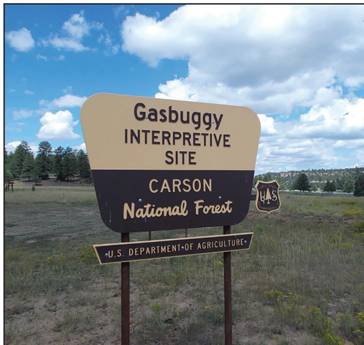
Gasbuggy, New Mexico, Interpretive Site

The site is located in the Carson National Forest. Prior to Project Gasbuggy, the land was open range and was used for livestock grazing and recreation. The Secretary of Agriculture, through the U.S. Forest Service, has jurisdiction over Carson National Forest. There are no surface use restrictions for the site, and the Forest Service has returned the land to its pre-Gasbuggy uses with the addition of historical markers describing the Gasbuggy test and a small parking area at Surface Ground Zero.