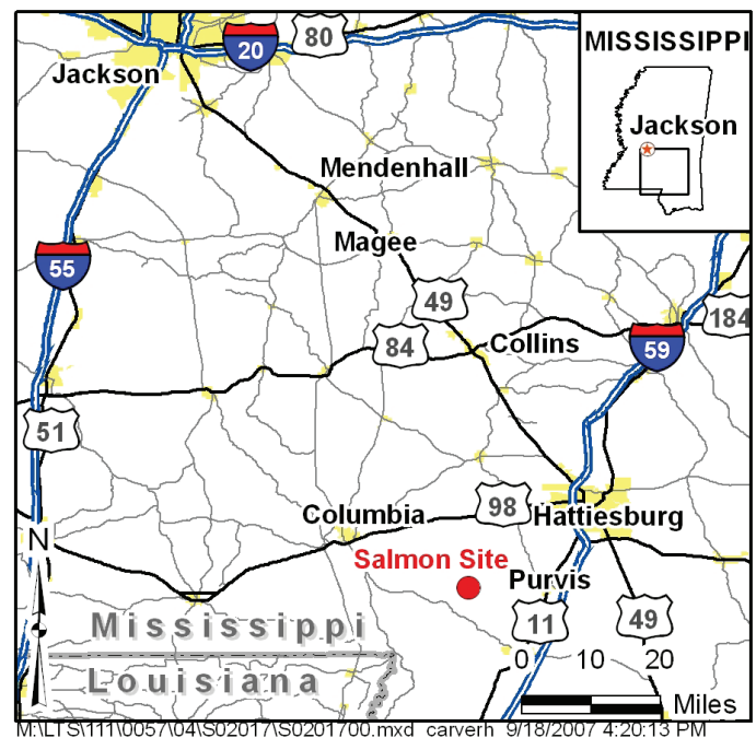
Location of the Salmon, Mississippi, Site

Projects Salmon and Sterling were designed to evaluate seismic signals from detonations in a salt medium (the Tatum Salt Dome). The Salmon and Sterling tests were the second and fourth nuclear tests in the program. The Salmon test took place on October 22, 1964, at a depth of 2,700 feet below ground surface, which is approximately 1,200 feet below the top of the salt dome. This 5.3-kiloton-yield test created an