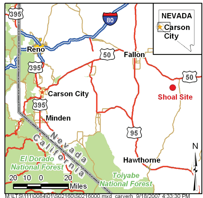
Location of the Shoal, Nevada, Site

Performed on October 26, 1963, the Project Shoal test consisted of detonating a 12-kiloton nuclear device in granitic rock at a depth of approximately 1,211 feet below ground surface. The device was put into place via a shaft located approximately 1,000 feet west of Surface Ground Zero. The shaft was mined to a depth of approximately 1,315 feet below ground surface. At that depth, a drift (a nearly horizontal tunnel) was mined approximately 300 feet west and 1,050 feet east, ending in a 30-foot vertical "buttonhook" where the nuclear device was emplaced. Re-entry drilling directly over the blast cavity indicated that the Shoal device detonated as predicted, and a rubble chimney about 171 feet in diameter and 356 feet high formed above the explosion shot point. No radiation escaped to the