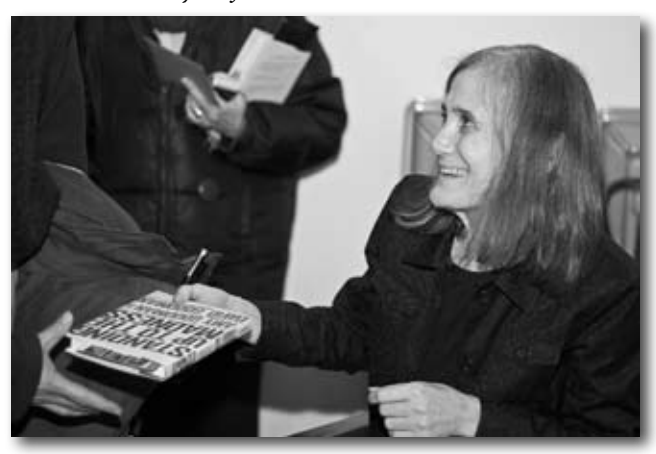
Amy Goodman lectures in Berlin December 12, 2008