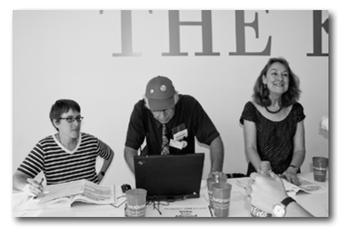
Voter Registration with Democrats Abroad Berlin, July 5, 2008