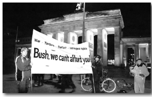
Brandenburg Gate, January 19, 2005

www.avasgreensalon.wordpress.com www.facebook.com/avastransatlantic