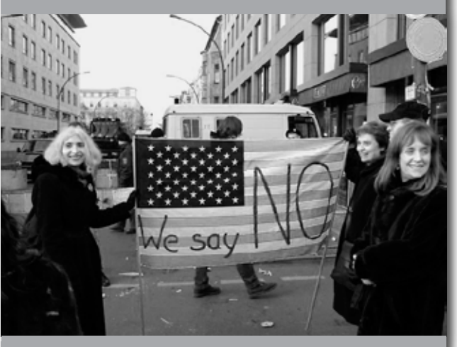
Protesting the Iraq War by the US Embassy, Berlin, March 20, 2003

To get on our mailing list contact: members-berlin@americanvoicesabroad.net